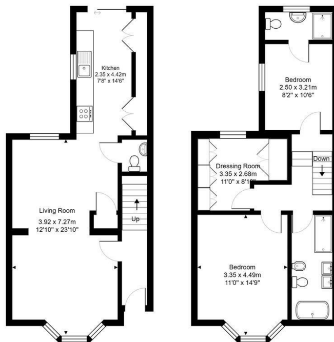
Osborne Villas, Hove Total Area: 93.1 m 2 ... 1002 ft 2 All measurements are approximate and for display purposes only.