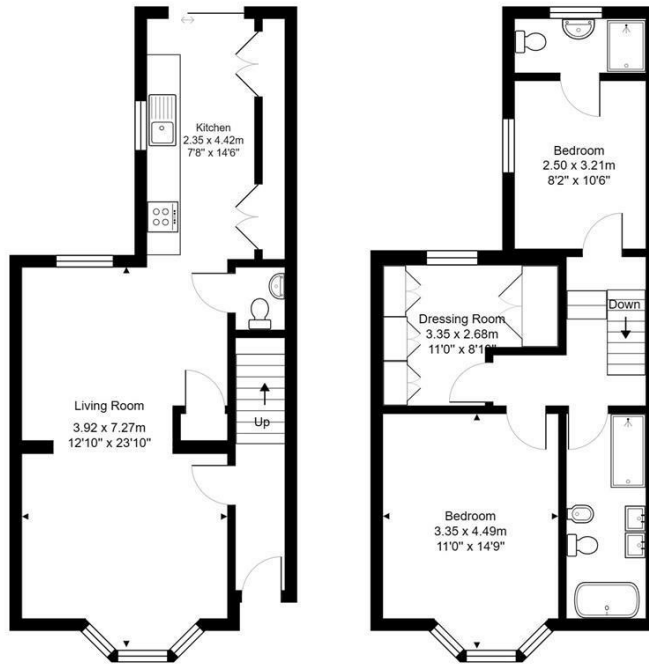
Osborne Villas, Hove Total Area: 93.1 m 2 ... 1002 ft 2 All measurements are approximate and for display purposes only.