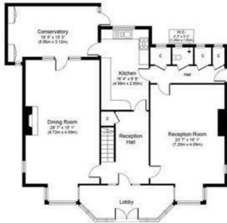
Ground Floor Approximate Floor Area 1,483 sq. ft. (137.7 sq. m.)