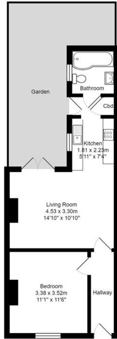
Clarendon Road Total Area: 47.0 m 2 ... 506 ft 2 (excluding garden) All measurements are approximate and for display purposes only.