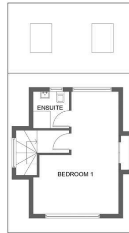
PROPOSED SECOND FLOOR PLAN