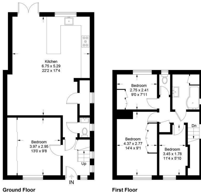
Illustration for identification purposes only, measurements are approximate, not to scale. Fourlabs.co © (ID1224773)

Approximate Gross Internal Area = 99.2 sq m / 1068 sq ft