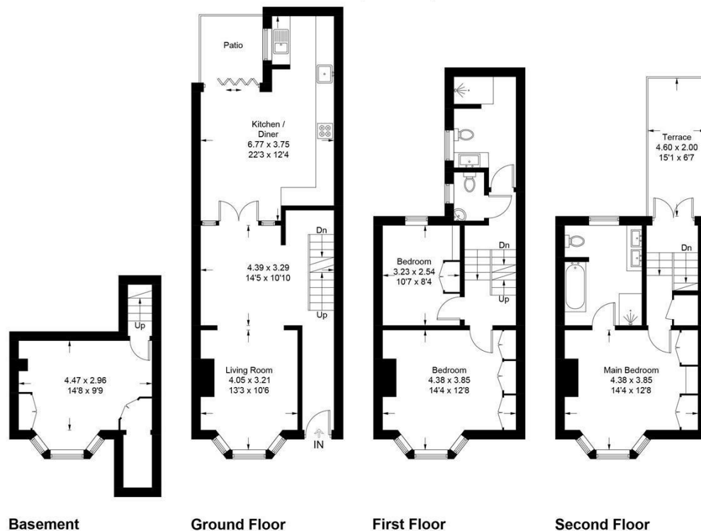
Illustration for identification purposes only, measurements are approximate, not to scale. Fourlabs.co © (ID1217870)