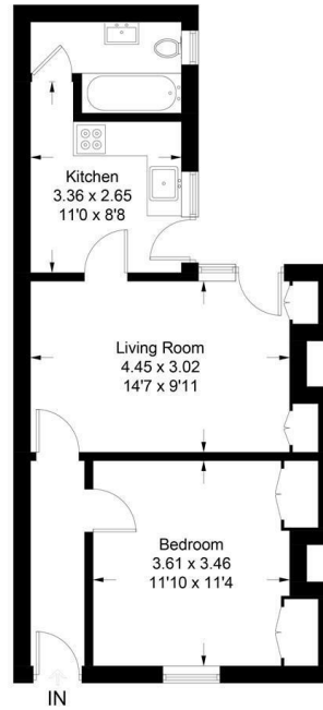
Illustration for identification purposes only, measurements are approximate, not to scale. Fourlabs.co © (ID1229554)

Approximate Gross Internal Area = 45.2 sq m / 486 sq ft