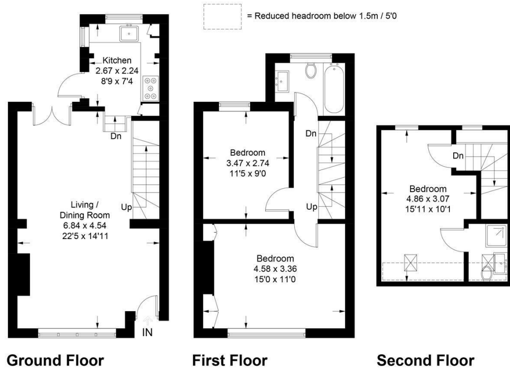
Illustration for identification purposes only, measurements are approximate, not to scale. Fourlabs.co © (ID1243408)

Approximate Gross Internal Area = 92.5 sq m / 996 sq ft