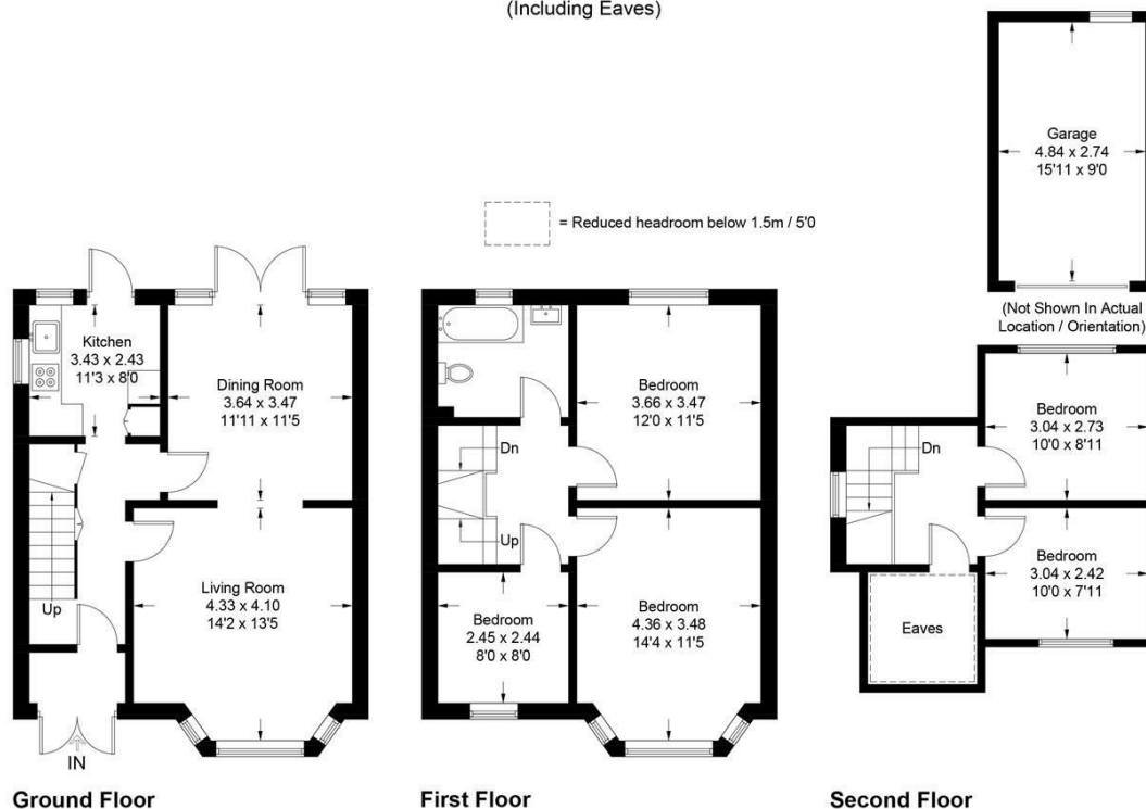
Illustration for identification purposes only, measurements are approximate, not to scale. Fourlabs.co © (ID1205947)

Total = 135.3 sq m / 1456 sq ft (Including Eaves)