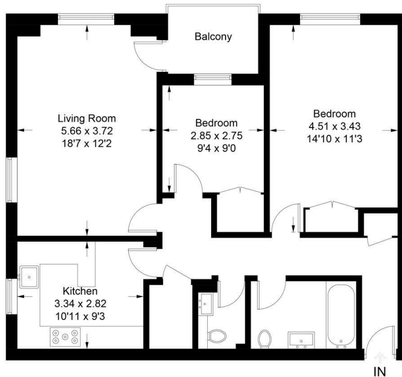
Illustration for identification purposes only, measurements are approximate, not to scale. Fourlabs.co © (1234869)

Approximate Gross Internal Area = 82.3 sq m / 886 sq ft