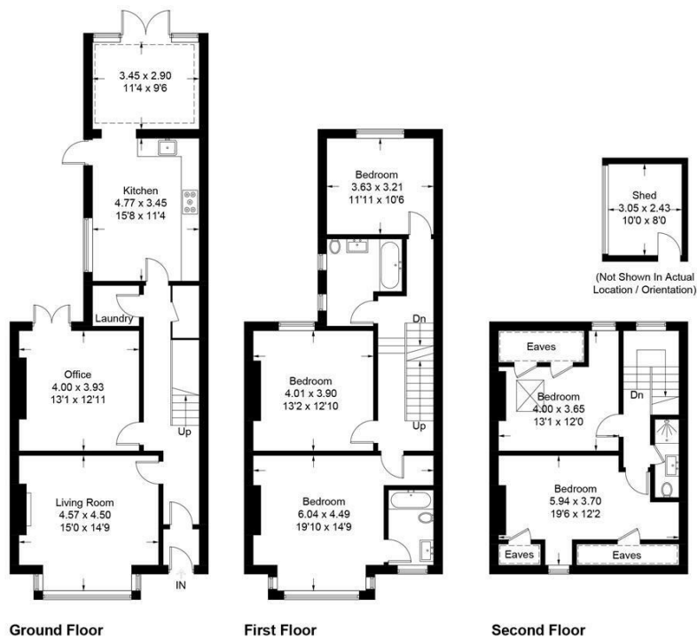
Illustration for identification purposes only, measurements are approximate, not to scale. Fourlabs.co © (ID1208645)

Approximate Gross Internal Area = 202.9 sq m / 2184 sq ft (Including Eaves) Shed = 7.5 sq m / 81 sq ft Total = 210.4 sq m / 2265 sq ft