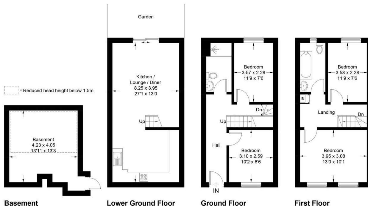
Illustration for identification purposes only, measurements are approximate, not to scale. Fourlabs.co © (ID1267135)