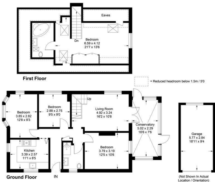
Illustration for identification purposes only, measurements are approximate, not to scale. Fourlabs.co © (ID1290815)

Approximate Gross Internal Area = 137.8 sq m / 1483 sq ft (Including Eaves) Garage = 16.4 sq m / 176 sq ft Total = 154.2 sq m / 1659 sq ft